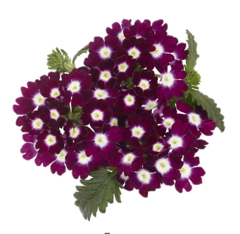
Empress Burgundy Charme 42174