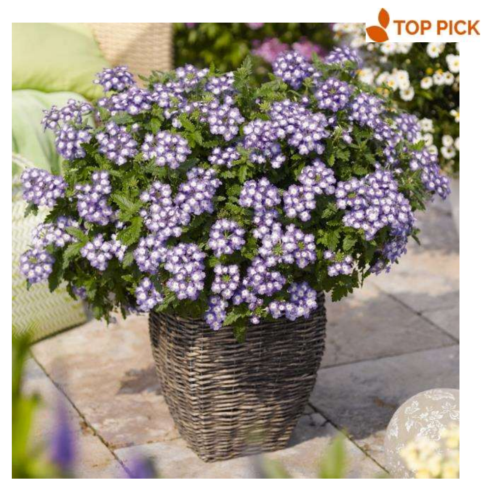
42280 Empress Flair Blue Charme