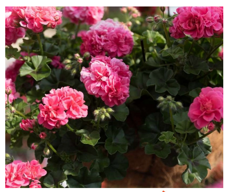
20494 NEV Great Balls of Fire Pink