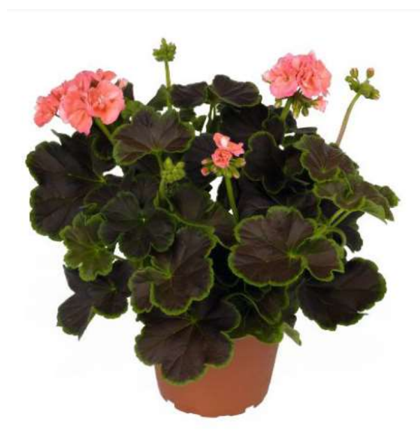
21973 Brocade Salmon Night