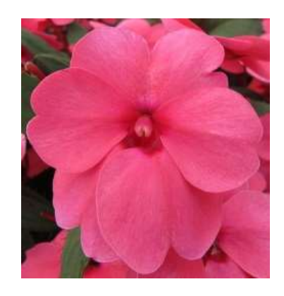
32483 SunStanding Pink