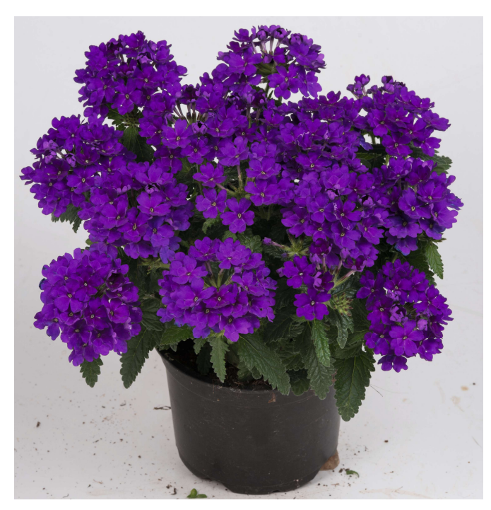
Empress Flair Blue 42326