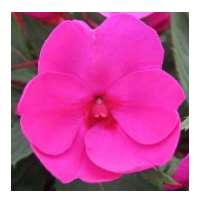
32447 SunStanding Purple