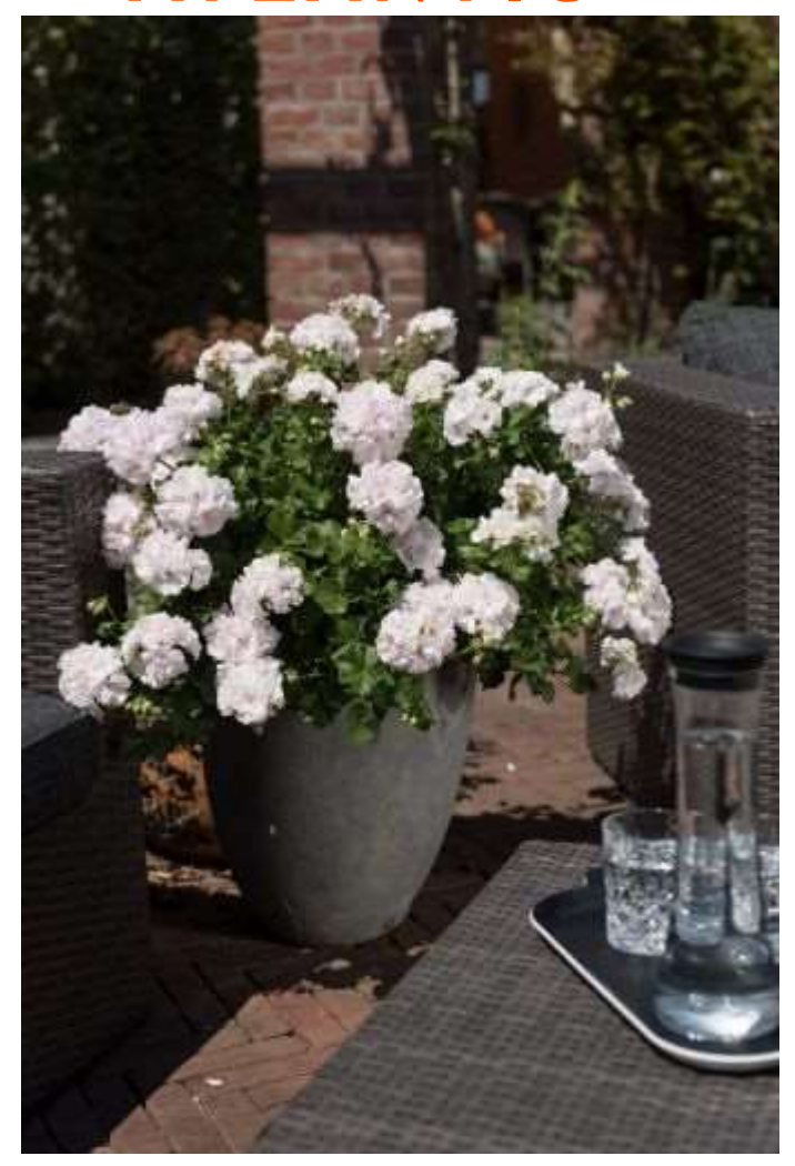
21432 Atlantic White