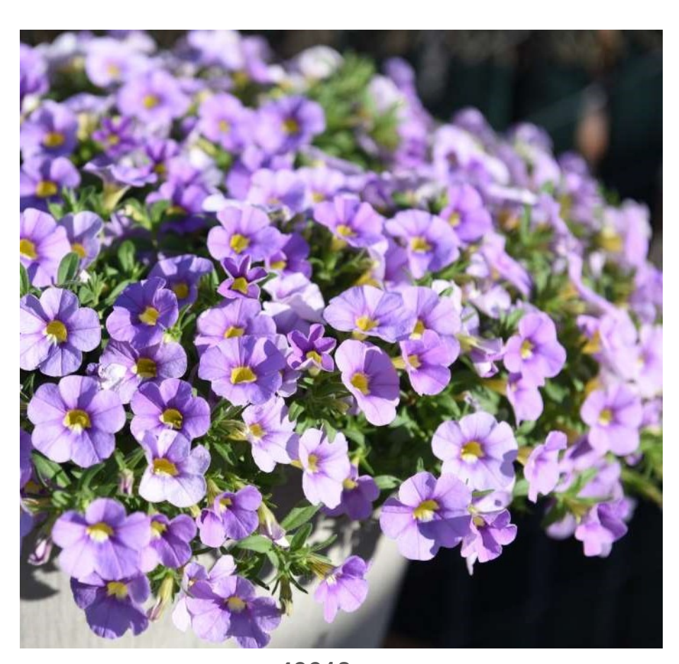
43618 Aloha Classic Blue Sky