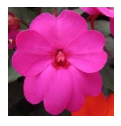
32484 SunStanding Lilac