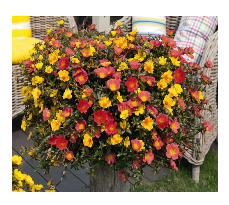
44424 Confetti Garden Cupcake Party