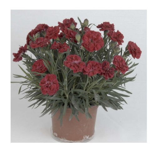
LEWIS LINDA New