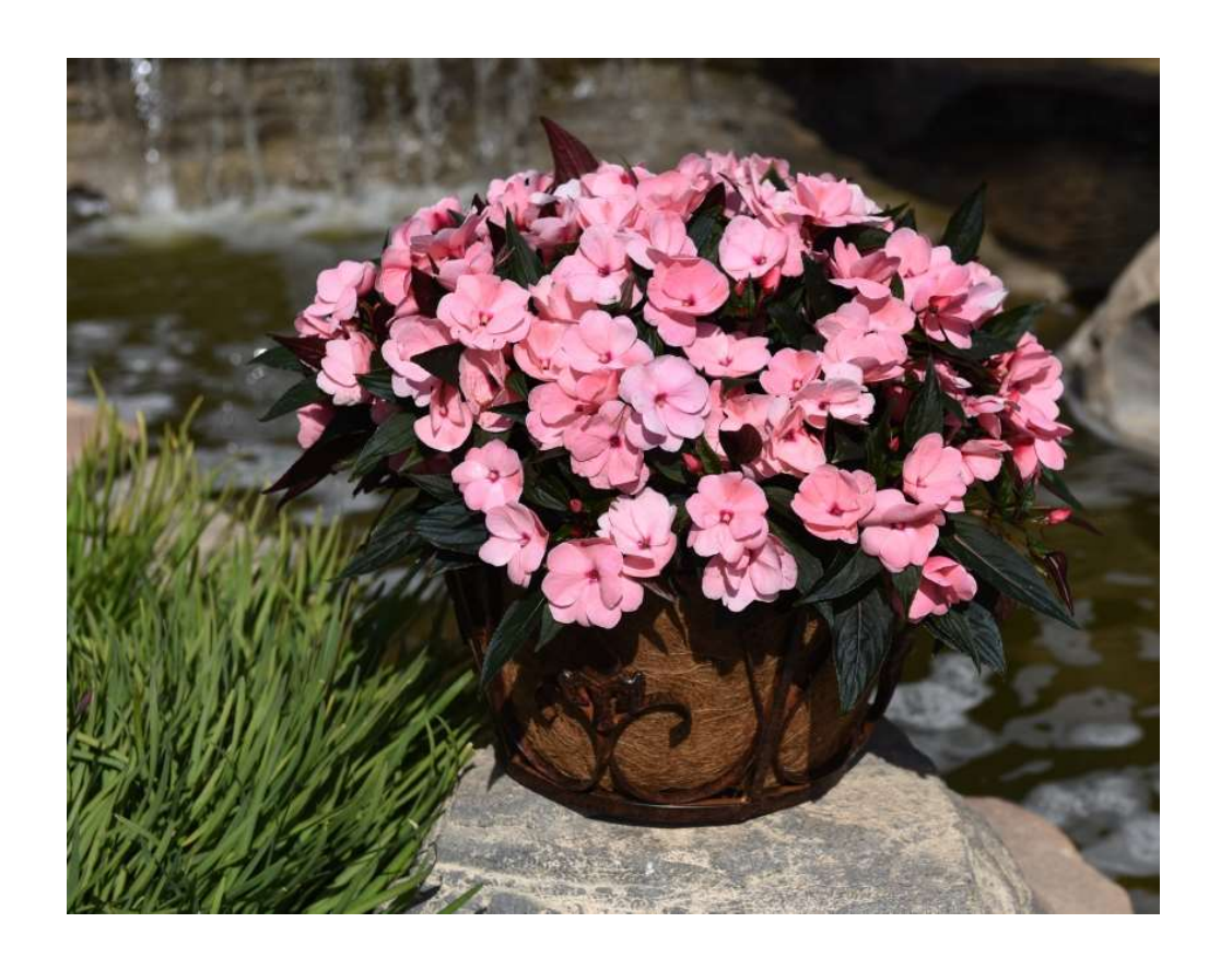
30191 Tamarinda Soft Pink