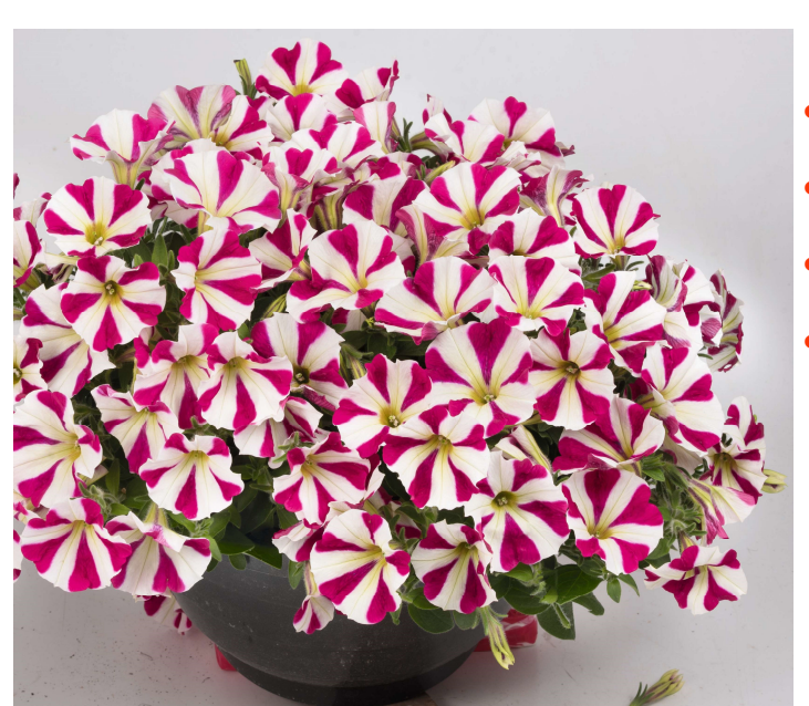
41517 Surprise Cerise Star