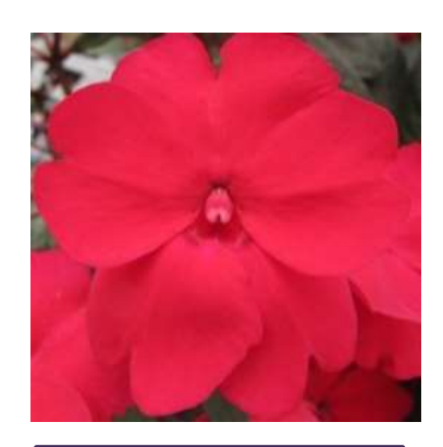
32485 SunStanding Ruby Red