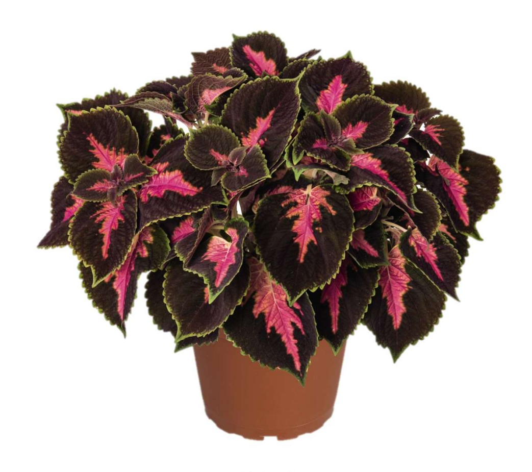
Main Street Fifth Avenue 70755