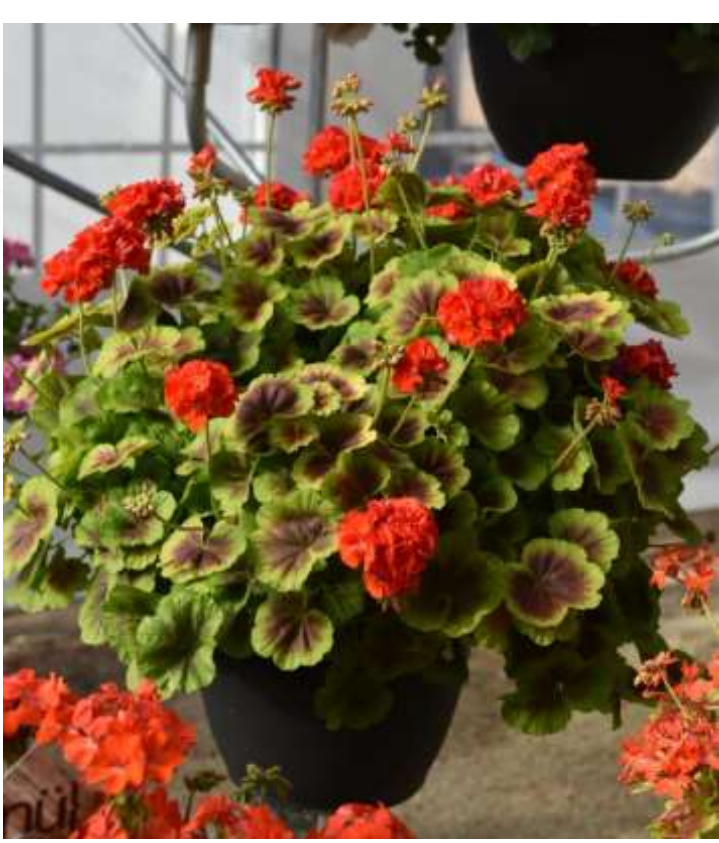
21971 Brocade Fire