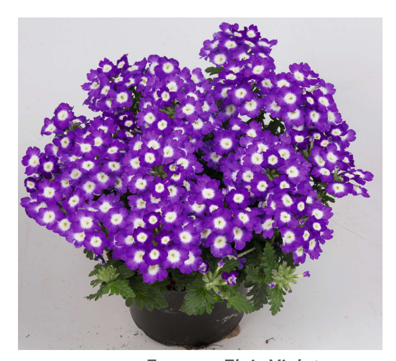
Empress Flair Violet Charme 42118