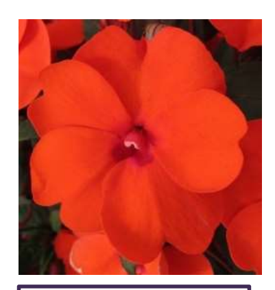
32482 SunStanding Orange