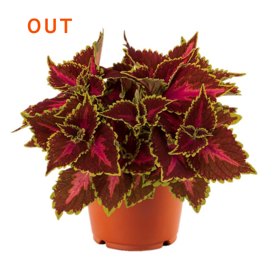
Main Street Ocean Drive 70963