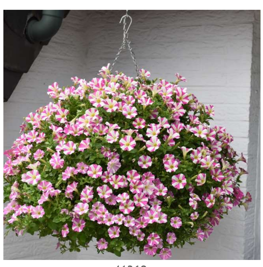
41362 Peppy Pink