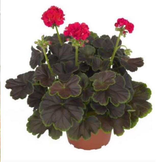
21974 Brocade Cherry Night