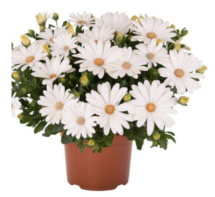
60531 Margarita Plus Cream